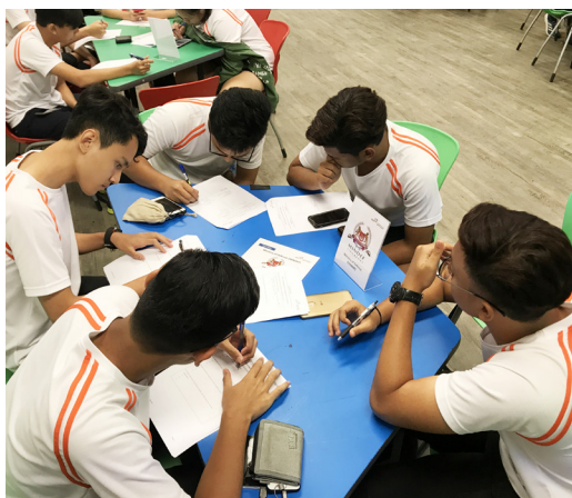
Members in the Prime Minister's Office planning their speech

Scenario will be created where the Parliamentary Session is in order and Ministers / Members of Parliament will be invited to share their stand on the motion. Everyone will be asked to cast their votes to support or go against the motion.