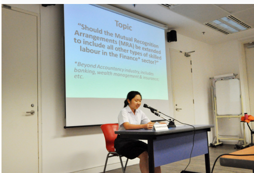
Delegate presenting her opening remarks on the motion

"This is a good programme for students where we are taught important knowledge about global issues and challenges."