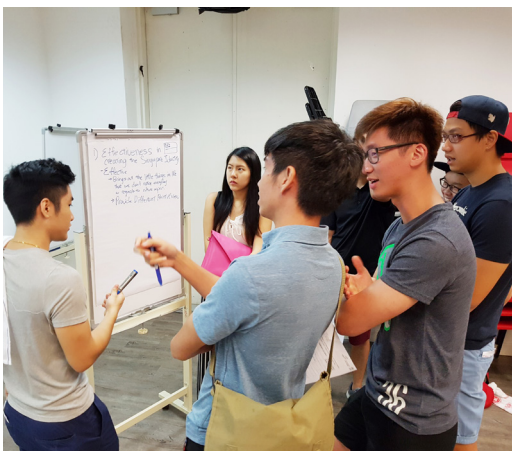
Students discussing factors important to national identity

This programme adopts the inquiry-based and experiential learning approaches to challenge students to (re)evaluate their understanding of nation building and the Singapore identity, giving them a platform to exercise critical thinking and also to inculcate 21st Century Competencies.