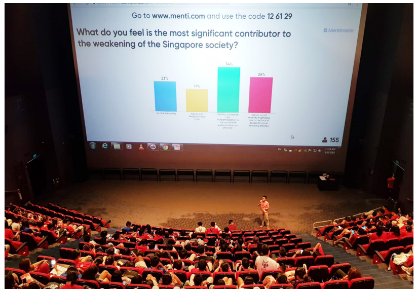
Discussing the results of the opinion poll