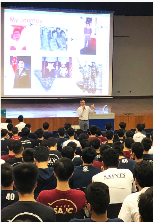
Students learning from an experienced army personnel

Through interaction with our speakers with relevant experience in their respective fields, this programme aims to provide students with insights into latest issues in political, economic and social developments that affect the Singaporean way of life. There are three popular topics, which are relevant to subjects such as General Paper, Current Affairs and National Education.