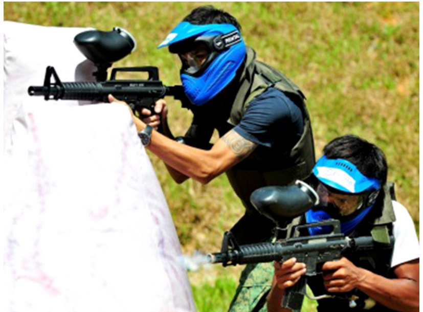
Students learning how to target accurately with the paintball markers

*Complimentary bus transport (T&C apply)