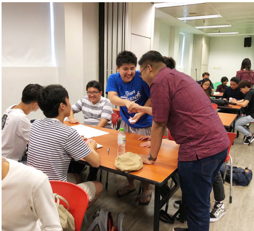
Representatives from different countries trying to understand each other first before making agreements on the next step to take

*Complimentary bus transport (T&C apply).