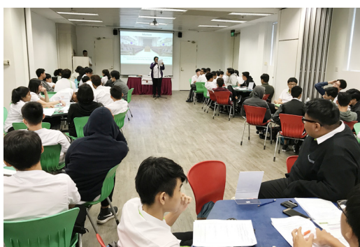
A "MP" sharing her speech