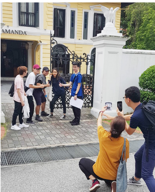
Juxtaposing old and new in a photograph