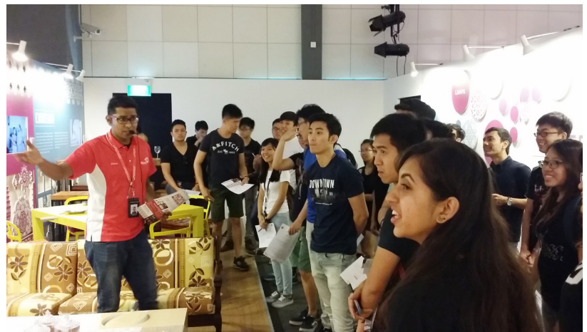
Guided tour where participants are introduced to elements of the Singaporean identity