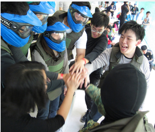
PSEI students cheering prior to inter-team paintball competition