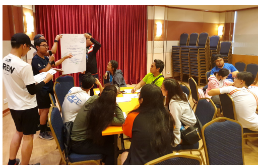
Using Future Economy strategies to come up with a business plan for industries in Jurong

*Complimentary bus transport (T&C apply)