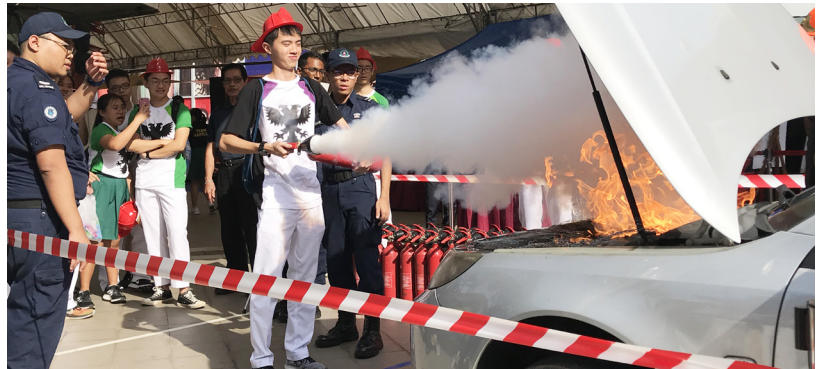
Students deploying fire fighting skills for Civil Defence learning station

Students will learn about the various aspects of Total Defence through exciting mission-based learning stations set up not only in the Permanent Exhibit Gallery (PEG), but also in the Special TD Exhibition. The programme will cover the impact that geopolitical issues have on Singapore, what we can do to stand against these threats and how we can build resilience through strengthening our understanding and application of Total Defence as one united nation braving new frontiers together.