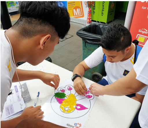
Traditional art and cultural activity challenges

This programme adopts an experiential learning approach which will appeal to students of different learning styles. There will be hands-on activities which introduce students to different cultures and practices of the different races in Singapore.