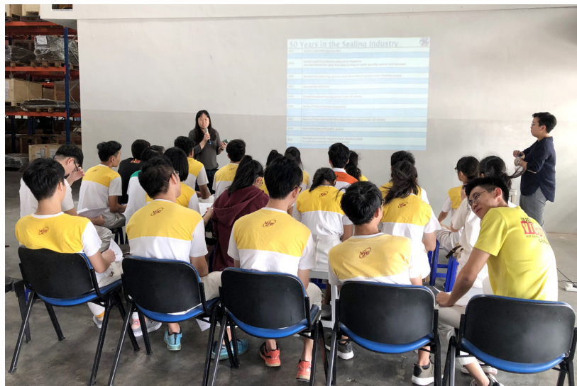
Hearing from an SME representative to learn more about what their business model is like

At the same time, students will also get a chance to work on a business proposal with reference to the recommendations made by the Committee of Future Economy and present their proposal to a panel of judges which will include representatives from relevant industry partners.