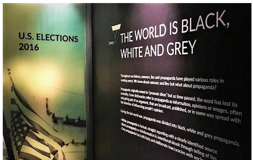
Information on the evolving nature of non-traditional security threats

Subject matter experts from different backgrounds will share rich knowledge and experiences to help students understand these pertinent issues better.