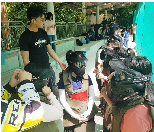
Students putting on their protective gear and getting ready for the paintball game

Be engaged in understanding the current climate of terrorism and envision how to play a part in keeping Singapore safe. Suitable for all students above 14 years old, students will experience a different approach via paintball gameplay in tackling the issue of counter-terrorism.