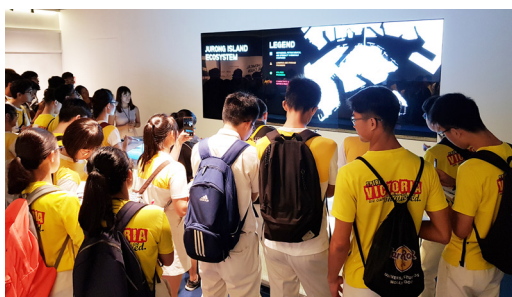
Students on their special visit to the Chem Gallery at Jurong Island

Was the idea of developing the Jurong Industrial Estate a crazy and impractical initiative? Apparently, it was not deemed as feasible when it was first mooted. Fast forward to the present day, this initiative is now seen as an important and groundbreaking project as we see the economic transformation of the Jurong area across time and space.