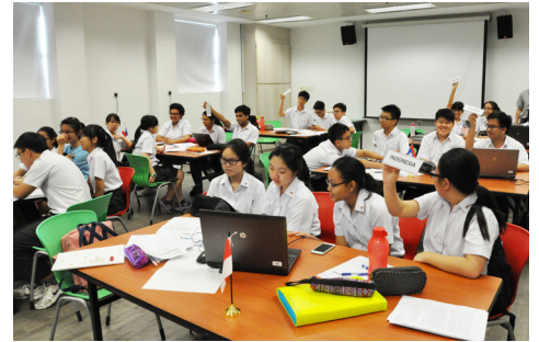
Delegates at the conference's roll call

In this programme, students will get the opportunity to learn about the workings of a mock conference and its role as an organ of inter-governmental organisations like the United Nations (UN) and ASEAN. They will also learn about issues pertaining to current affairs, international and bilateral relations as well as understanding some contemporary issues that are affecting Singapore and the rest of the world. It also provides a platform for students to hone their research, writing, public speaking and critical thinking skills, as well as promote teamwork and collaborative learning.