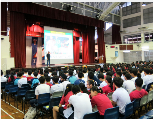
Students briefed on the importance of pro-active security and defence