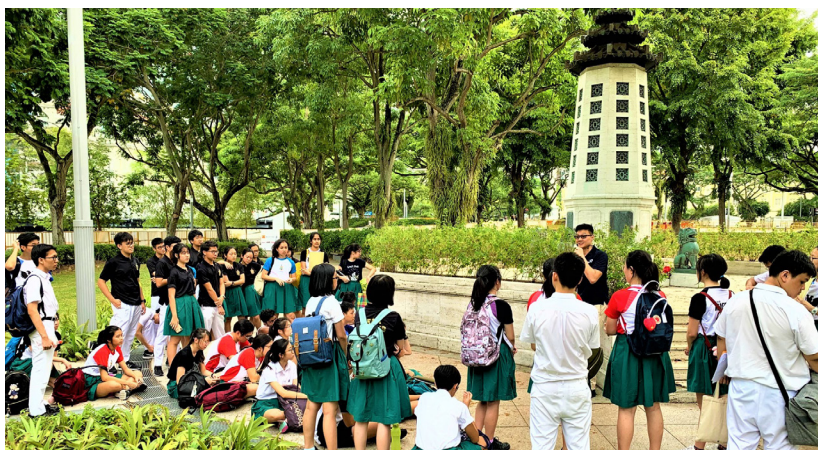
Debriefing for the students after completion of trail

At each site, students will uncover the historical context behind each landmark and discover how they are linked to Singapore's defence history.