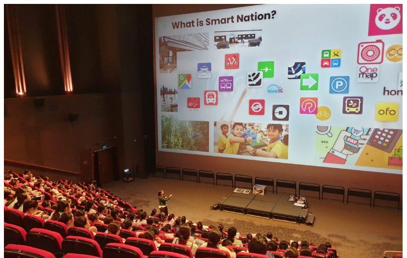
Students understanding about Smart Nation

Exams are over! Join us for a series of interactive activities designed to highlight the importance of innovation, and how we can push boundaries to create a more vibrant Singapore for everyone to live, work and play. Explore and understand Singapore's drive towards becoming a Smart Nation.