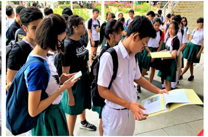
Students discussing on the course of action before trail

Students will embark on a self-directed mystery & game-based learning outdoor trail to uncover how security threats have evolved from overt inter-state aggression to one that could be more covert and sinister in nature. Students, in their small groups of five to six, will role-play as investigators on a mission to foil a bomb threat by deciphering clues and visiting six different historic sites that are suspected to be the possible locations of the bomb blast. Using clues obtained at each site, students will uncover the true culprits and better understand the evolving nature of today's security threats.