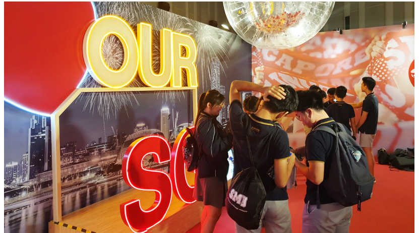
Solving tasks at the National Day Special Exhibition

Join us for an immersive learning experience to celebrate Racial Harmony Day and National Day. Explore how we can stay united and be proud of our unique Singaporean identity. Students will get to reaffirm their commitment to preserve a cohesive and harmonious society, as well as celebrate all the things that make us uniquely Singaporean.