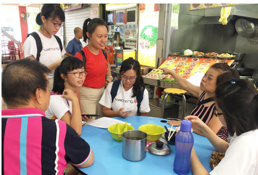
Speaking to residents in their designated locations

The outdoor trail uses the inquiry-based and experiential learning approaches as strategies for students to learn more about research methodologies. It also provides the opportunity for them to test their hypotheses using the skills that they have acquired.