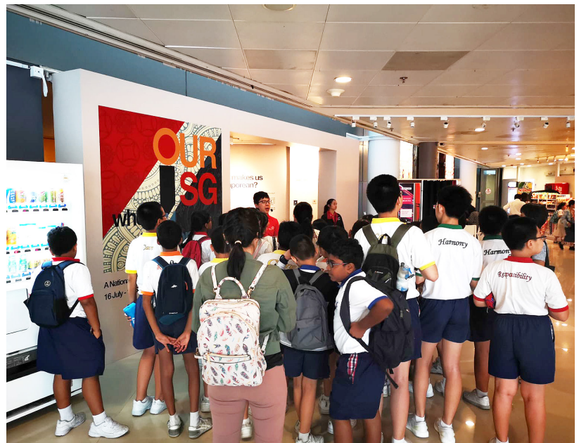
Guided tour of the Special Exhibition

Other learning stations will include interactive activities about our national identity and cultural diversity as well as an exciting team-based quest to get students to learn about the shared values, ideas and experiences that have shaped us as one Singapore.