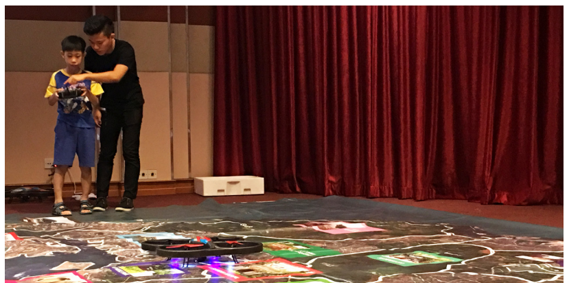
Hands-on fun flying a drone

"It is fun and we have learnt how innovation has played a key role in shaping Singapore." - Primary School Student