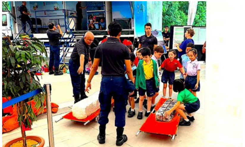
Students learning lifesaving skills from SCDF vehicular display station

“It was really good and I would bring my students back next year.” - Primary School Teacher