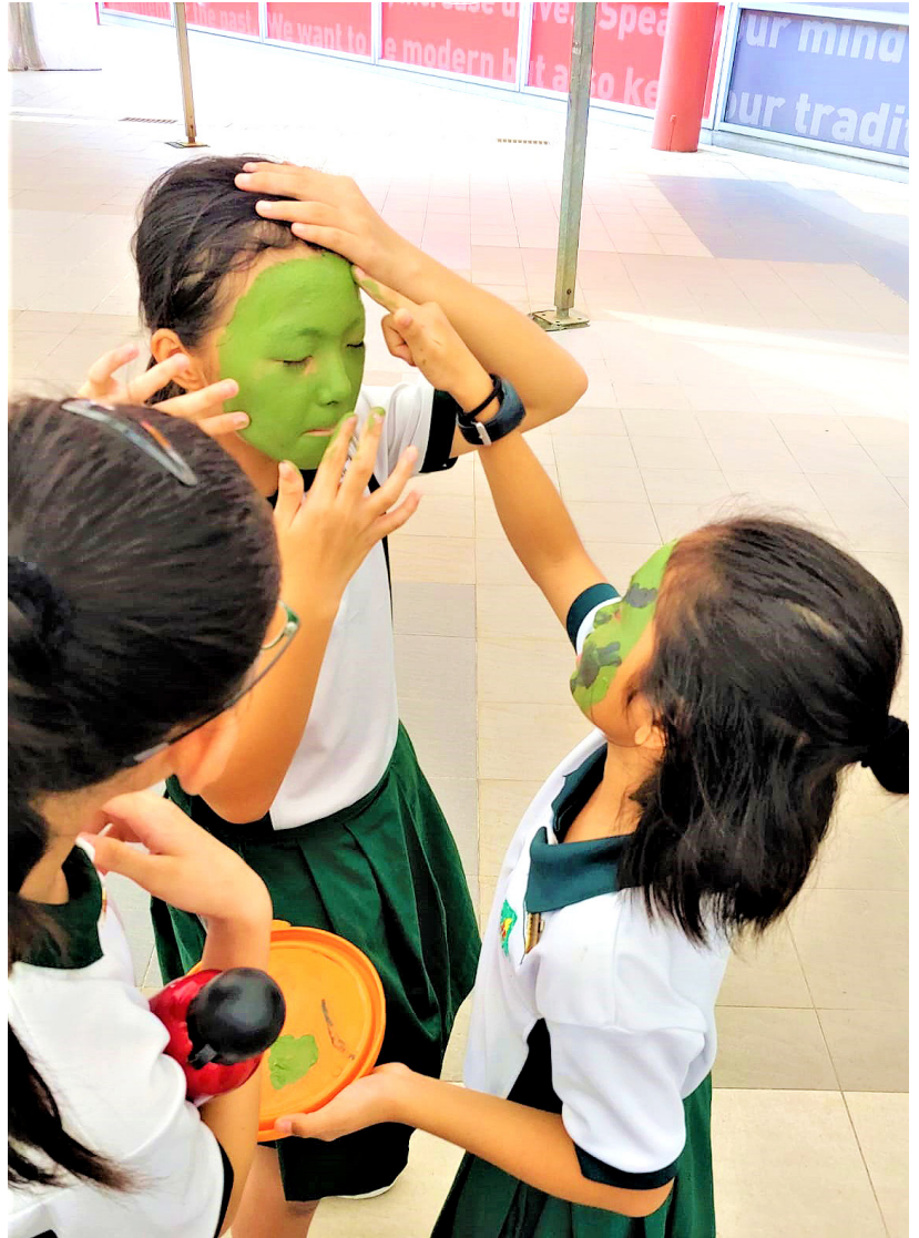
Students trying on army camouflage

Students will learn about the importance of military defence through engaging and varied activities such as field craft (includes basha pitching and camouflage), which will help them understand and affirm their commitment to defend Singapore.