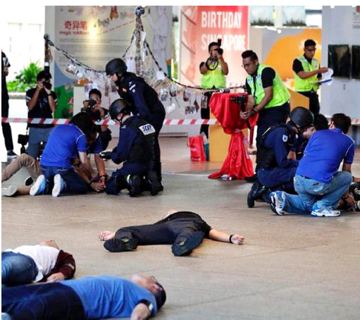
Students applying CPR lifesaving skills during anti-terror drills