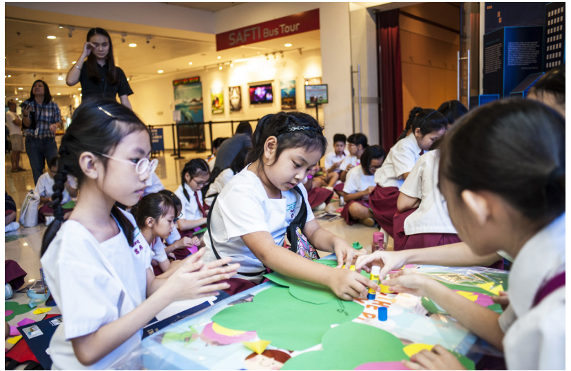
Engaging in a craft activity

Exams are over! Join us on an exciting journey to discover how Singapore is connected to Southeast Asia and the rest of the world. Through various fun and engaging activities students will learn the importance of friendship and cooperation for Singapore's growth and progress.