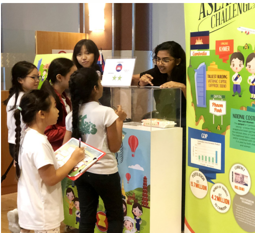
Role playing and gathering information

Be a soldier for the day and discover how combat rations from around the world can tell us interesting aspects of the countries' cultures and the importance of friendship between countries. Students will get to sample some combat rations in this immersive learning station.