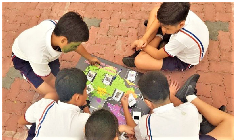
Students learning about Military Defence at the interactive learning station

Students will learn about the various aspects of Total Defence through exciting mission-based learning stations set up not only in the Permanent Exhibit Gallery (PEG), but also in the Special TD Exhibition. The programme will cover the impact that geopolitical issues have on Singapore, what we can do to stand against these threats and how we can build resilience through strengthening our understanding and application of Total Defence as one united nation braving new frontiers together.