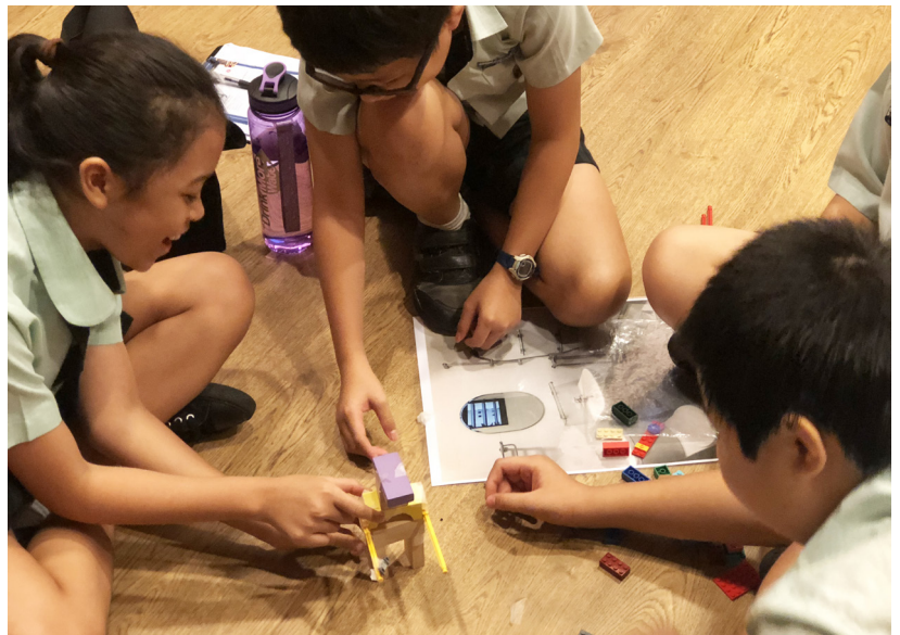
Designing "smart" solutions for the home

Get some hands-on fun in assembling and flying a drone that could perform a simple obstacle challenge. Students will also learn more about the use of drones in various contexts.